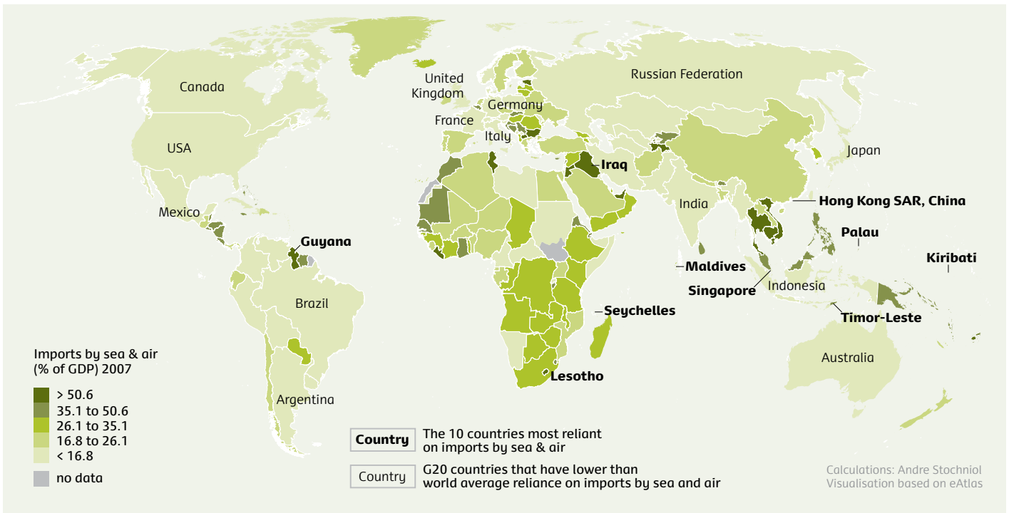
Figure 1 Imports by sea and air as a % of GDP (2007)

However, any such mechanism should ensure there are no negative impacts on developing countries, in line with the UNFCCC principle of CBDR. Poorer countries should be compensated to ensure that they are subject to no net incidence (cost burden) – an idea supported by the recent report by international organisations to the G20, which found that “the impact on developing countries of such charges would likely be modest and could be largely offset by explicit compensation schemes. Closer analysis of impacts is needed in order to design practicable compensation schemes, but enough has already been done to provide confidence that solutions can be found.” 16