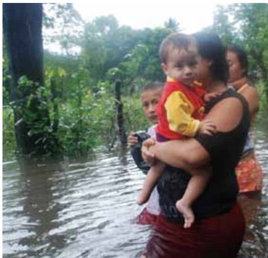
October 2011: The United Nations launched an appeal to help an estimated 300,000 people in El Salvador after heavy rains caused widespread flooding.

The impact on overall import prices to various countries is likely to be fairly uniform, estimated in the range of 0.2–0.3%. 19