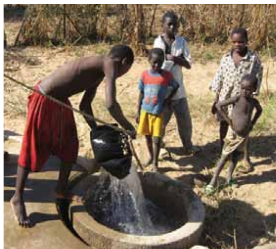
Climate change action: in Niger, water storage techniques are being used to stave off drought.

This analysis strengthens the case for compensating developing countries for the potential adverse impacts of carbon pricing on international transport.