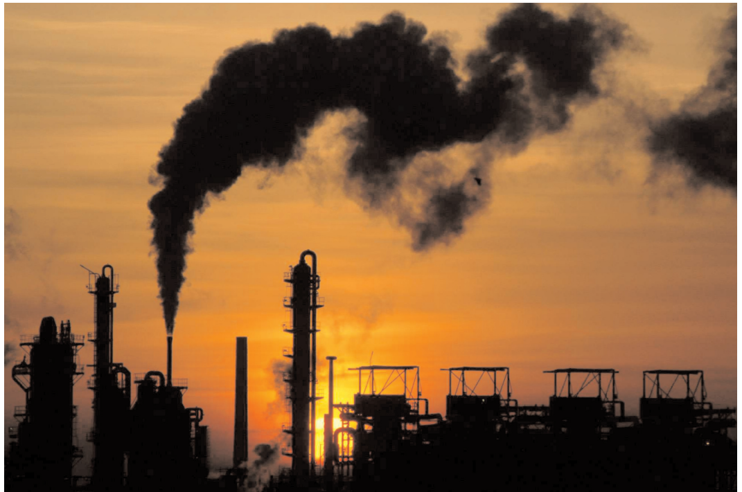
Sunset at the Wilton International Petrochemicals Complex